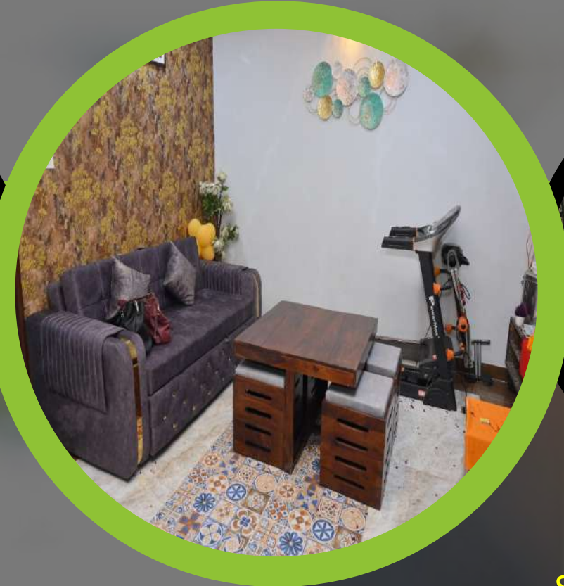
Indoor Gym with Treadmill and Tummy Tuck Vibrator