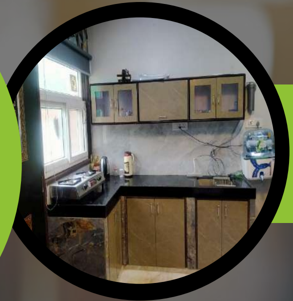
Furnished Kitchen Setup with Fridge, RO etc